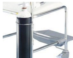
Oxygen Bottle Carrier