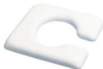
Handmade Open or Closed