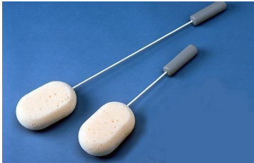
Long Handled Sponge