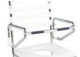
Folding Safety Arm