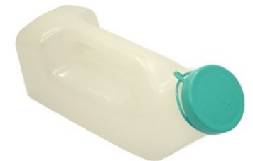
Urinal With Lid