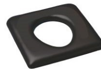
Pressure Care Open or Closed