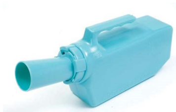
Spill Proof Urinal