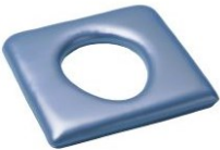
Polyurethane Open or Closed